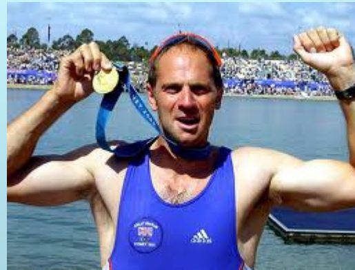
Steve Redgrave - rower 5 Olympic Gold medals Ulcerative Colitis