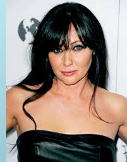
Shannen Doherty - actress Crohn's disease