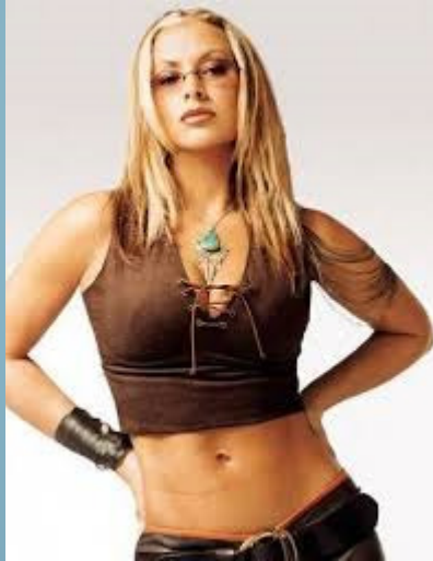
Anastacia – singer / songwriter Crohn's disease diagnosed age 13