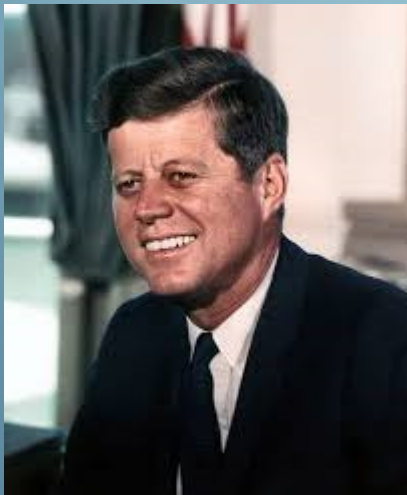
John F Kennedy Ulcerative colitis diagnosed age 13